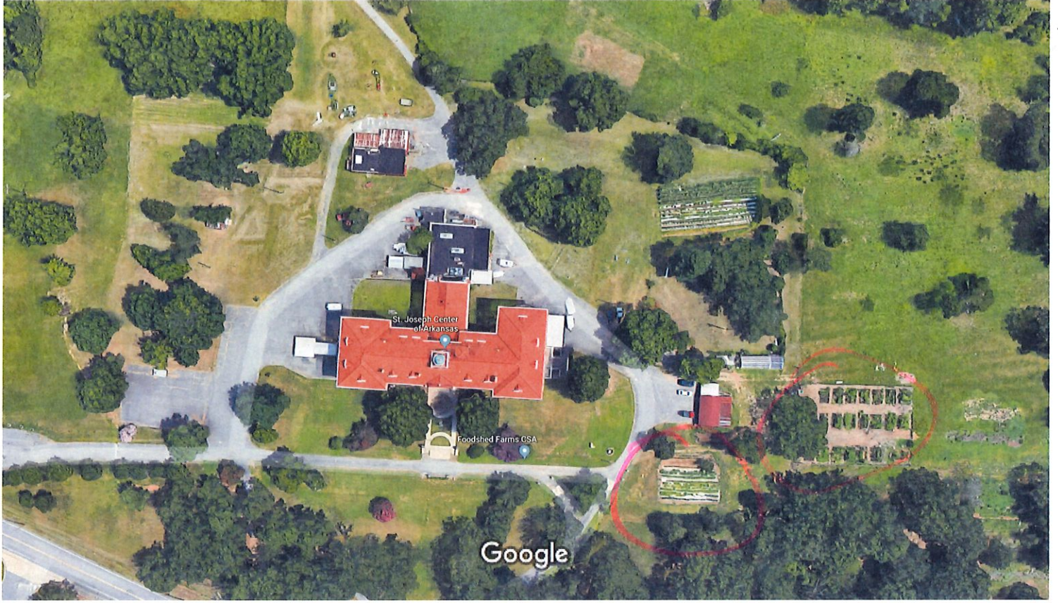
50 ft