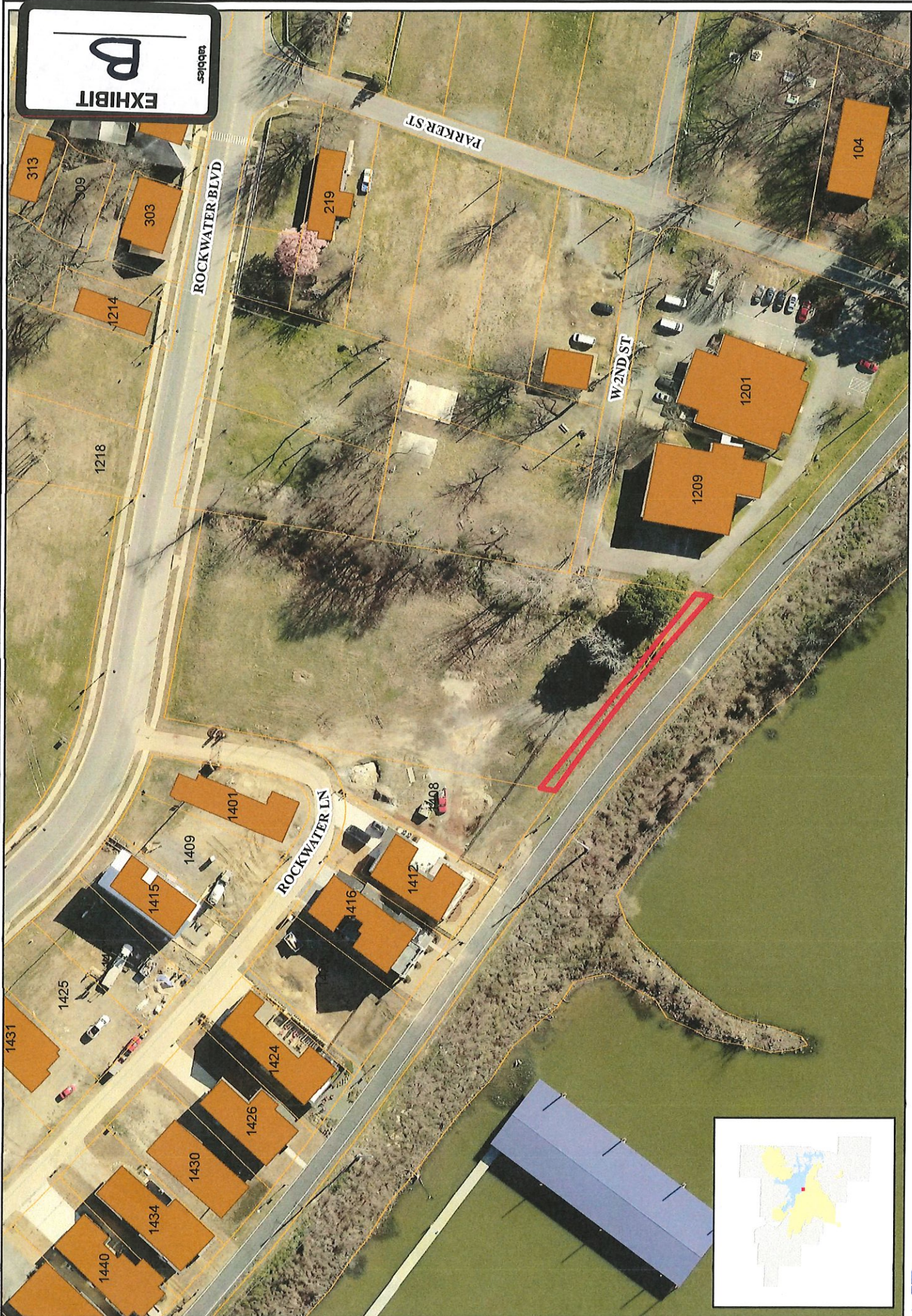
EXHIBIT B -3419988