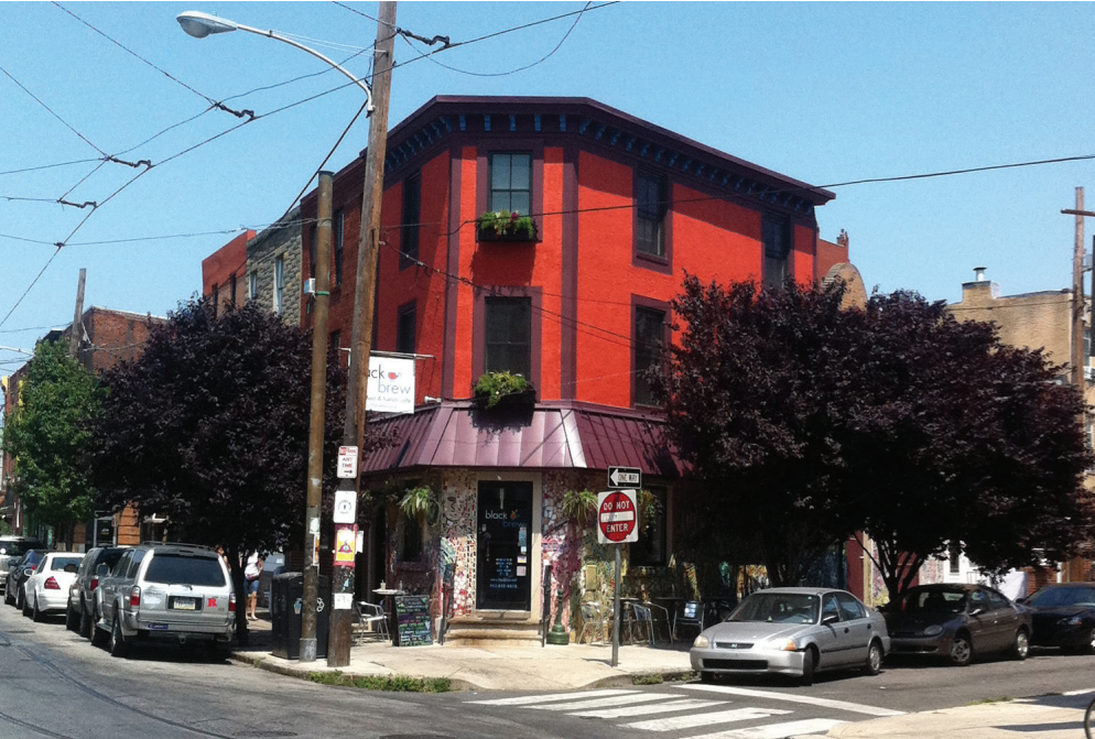
Corner Mixed-Use Building