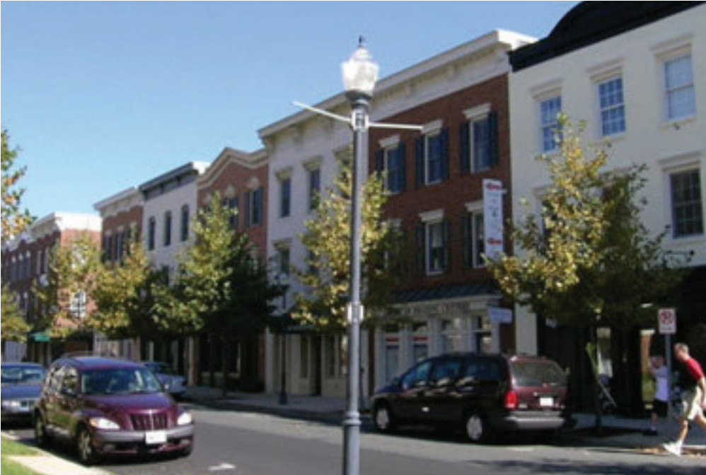
Live/Work Attached Buildings