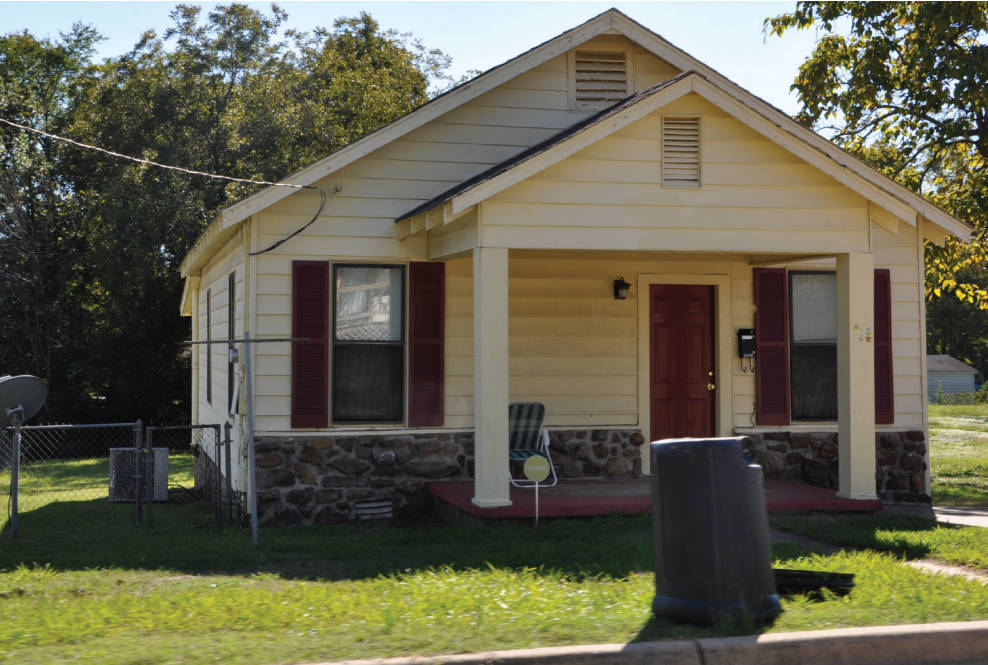
Typical home with front porch close to street