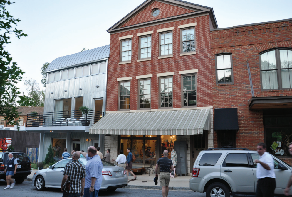
Retail-Office Mixed Use