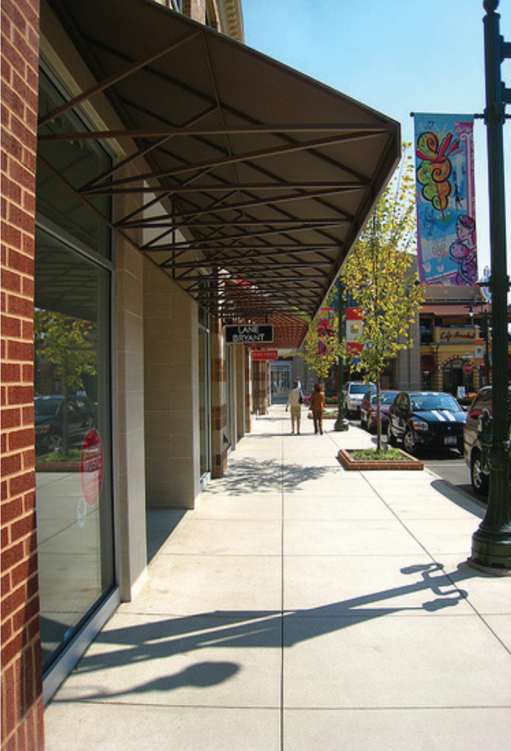
Walkable Retail Frontage