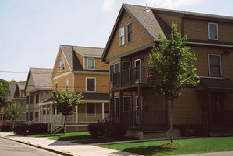
Multi-Unit Residential - 3 units