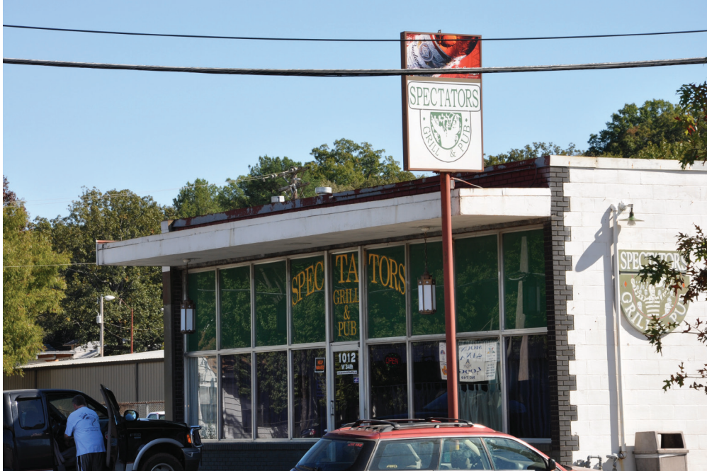
Successful Local Businesses