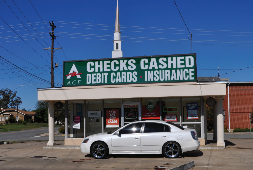
Entry gateway is lacking in a feeling of place