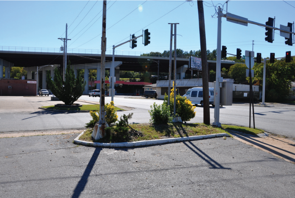
Hostile pedestrian environment