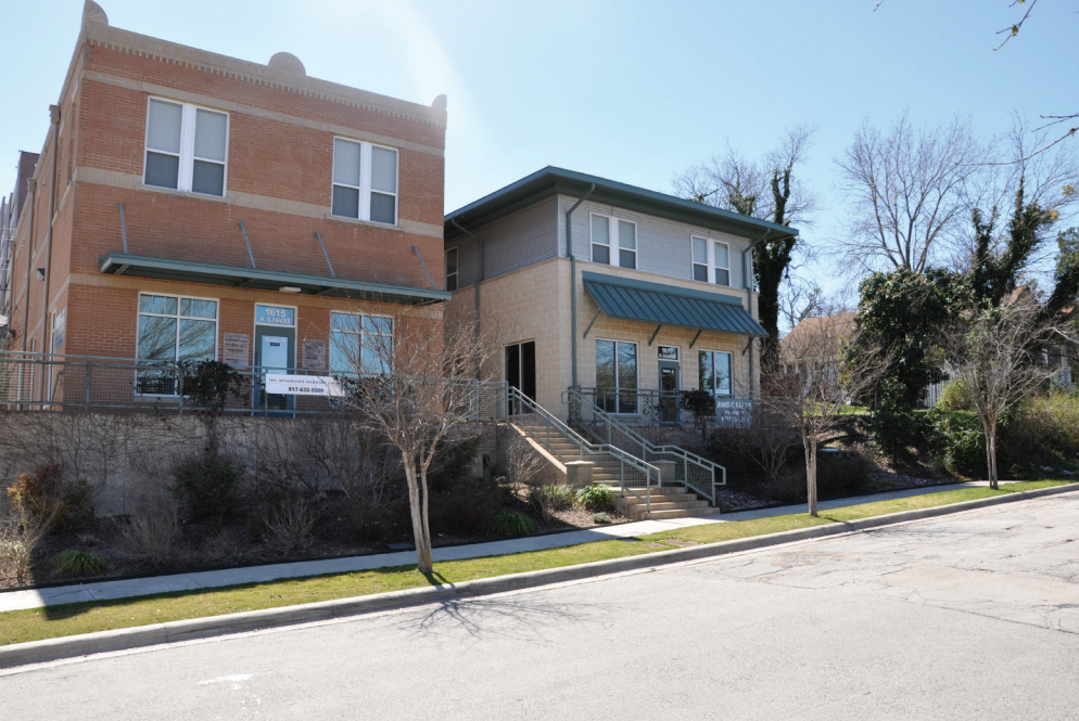
Live/Work Detached Buildings