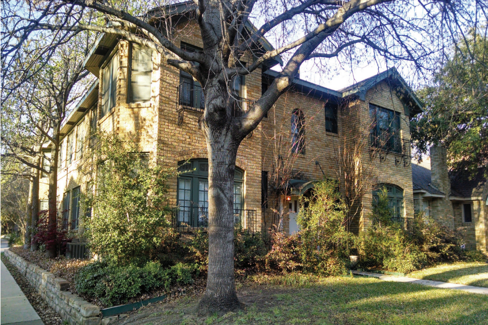
Multi-Unit Residential - 8 units