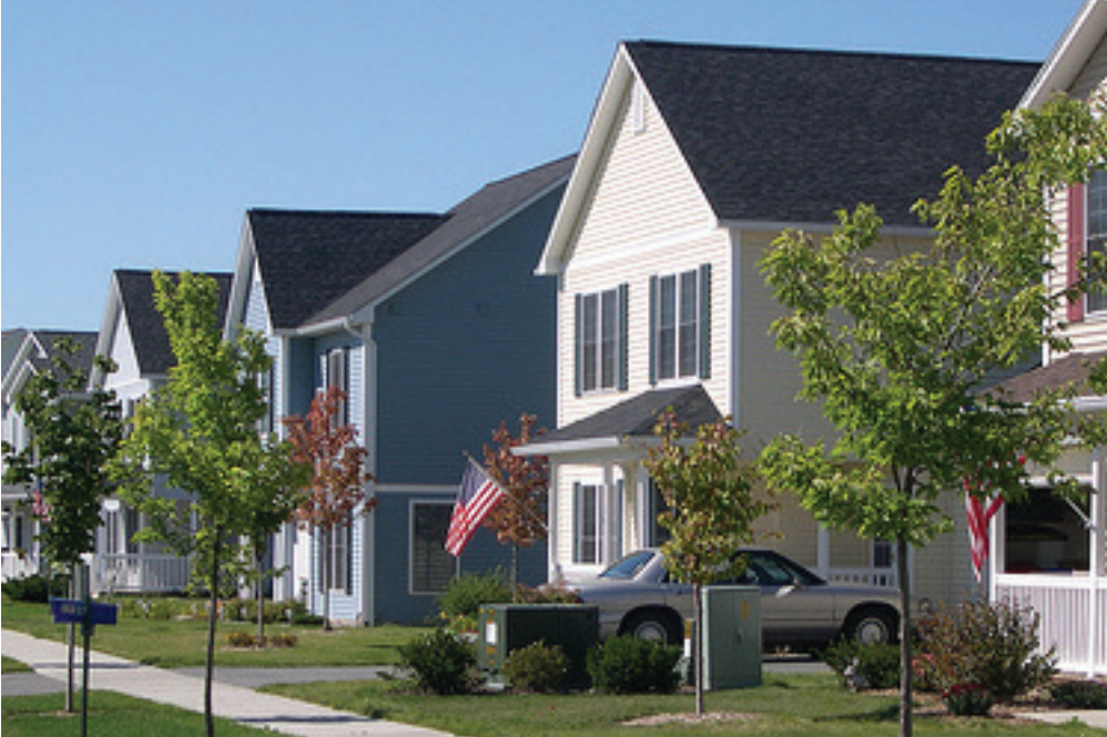
Front Porch Single Family Homes