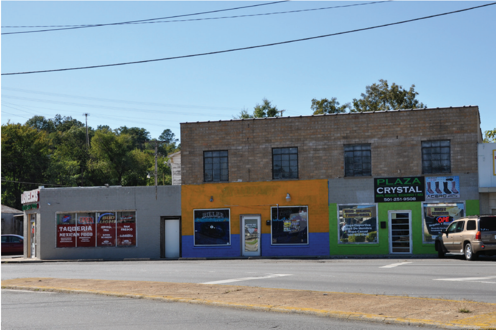
Low-rise Commercial with historic roots