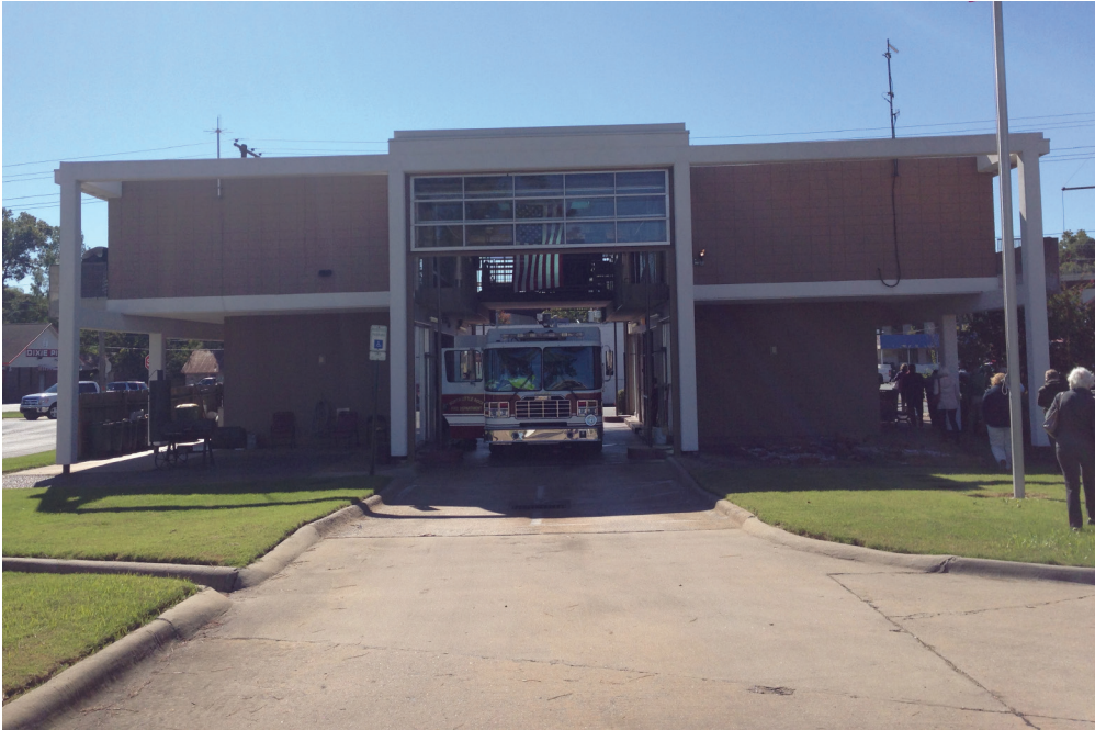
Iconic historic firehouse