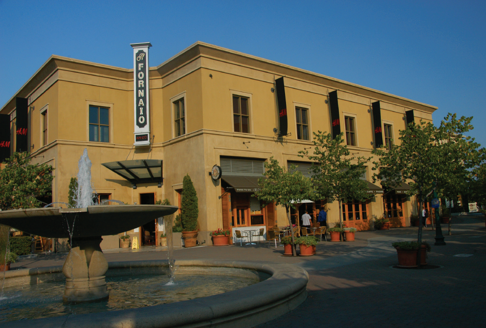
Retail-Residential Mixed Use